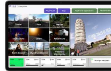
Care Tablet with Case (1x) (will arrive with case attached)