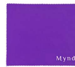
Mynd Cleaning Cloth (1x)