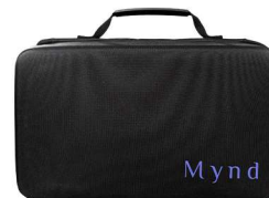
Hard Case with Custom Foam Insert (1x)