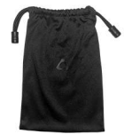
HTC Flow Protective Pouch (1x)